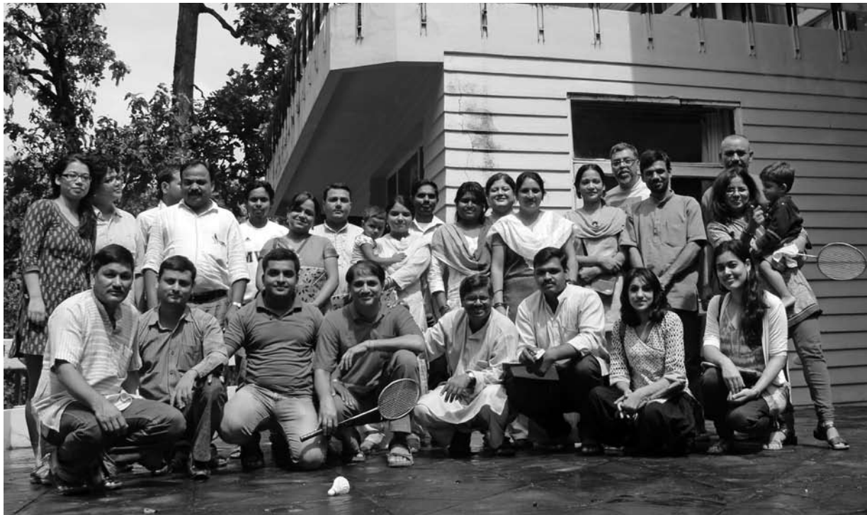
Staff Retreat from October 4-6, 2013 at Parsali, Sidhi district, Madhya Pradesh