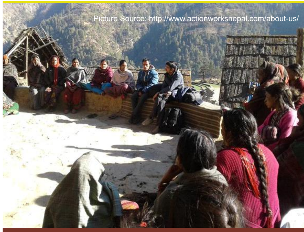
Group discussion at Rachuli, Kalikot