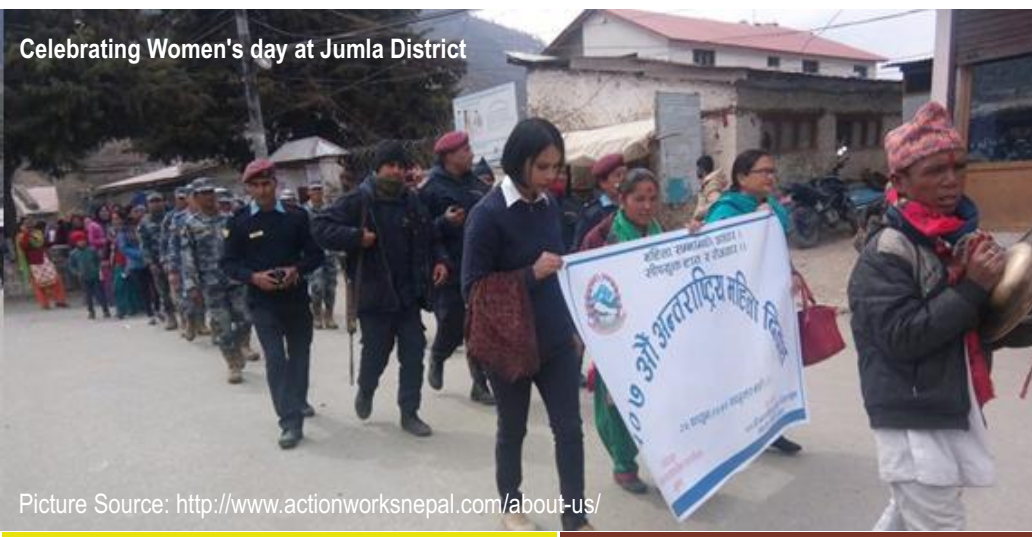
Celebrating Women's day at Jumla District