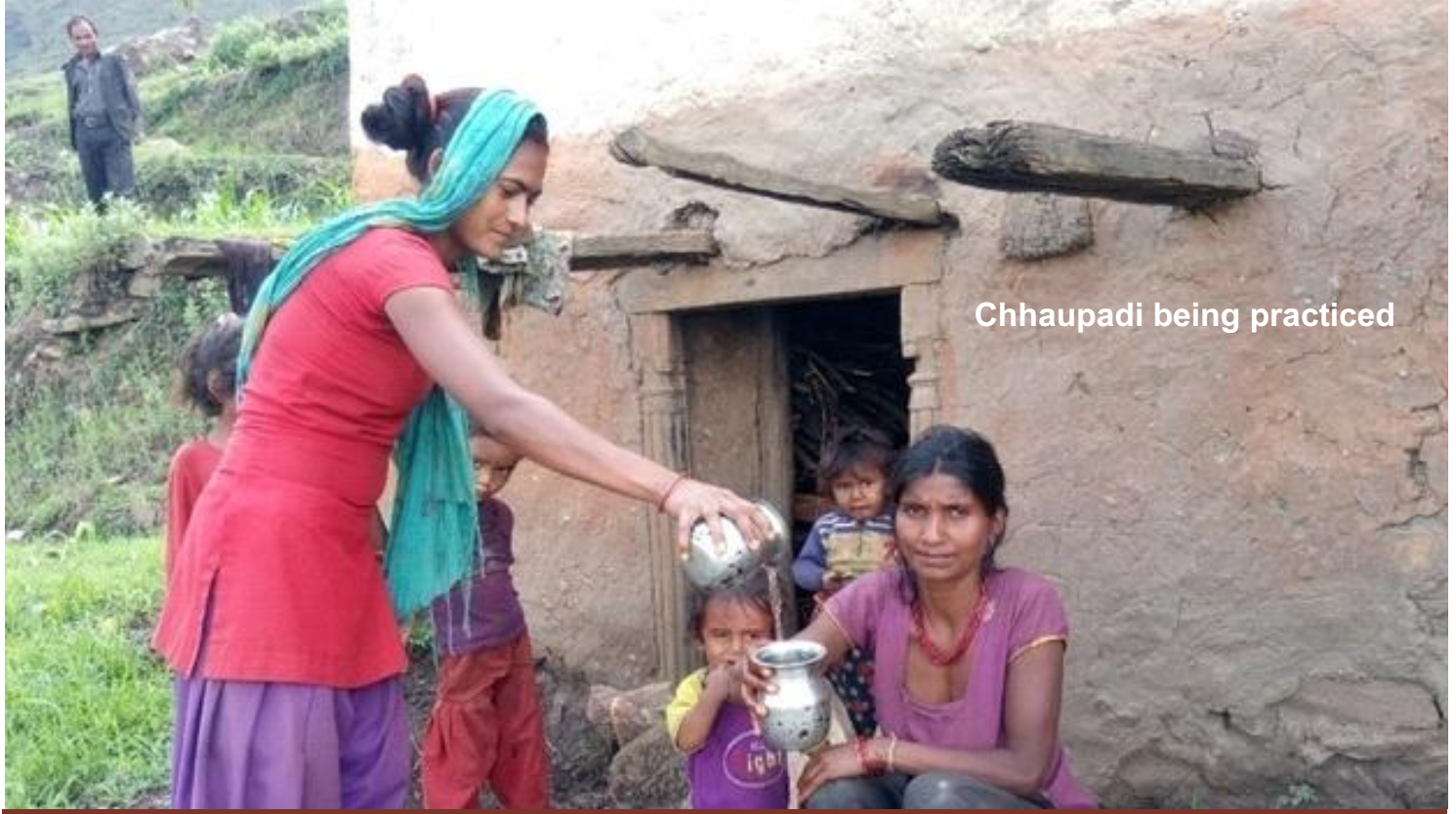
Chhaupadi being practiced

chhaupadi nationally (“Chhaupdi Pratha Unmulan Nirdesika” of 2064) in 2008 and the Constitution of Nepal's provision on gender equality.