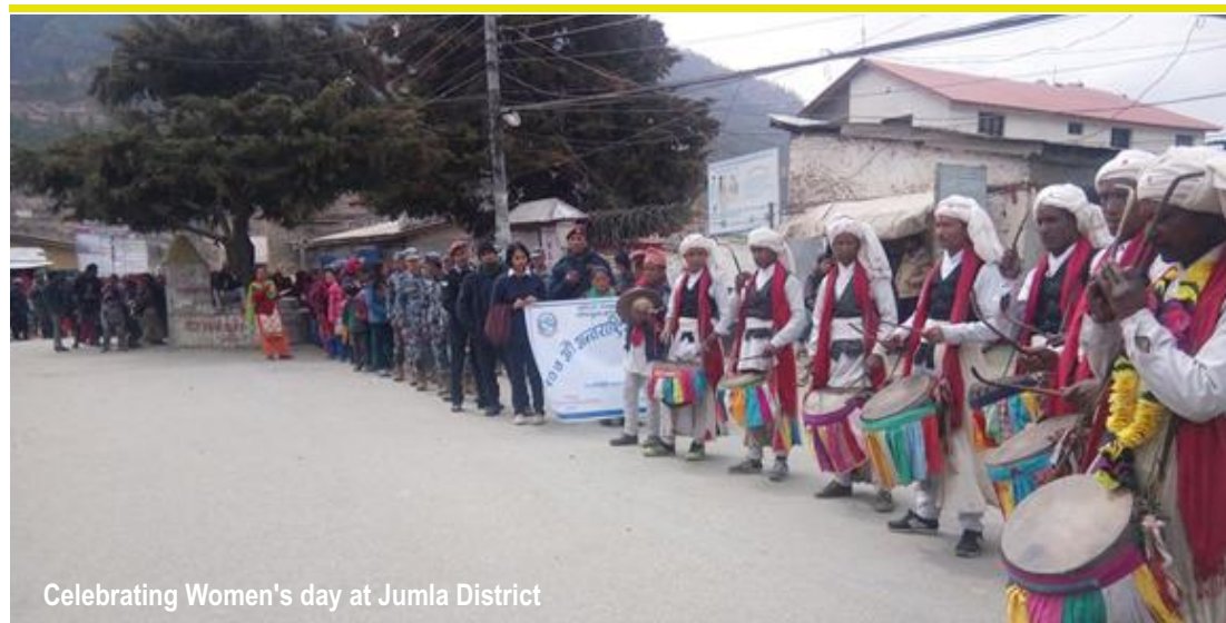
Celebrating Women's day at Jumla District

AWON is also working on sexual and reproductive health, and chhaupadi is a main issue that it engages with. AWON has been engaging men and boys in its interventions from inception. It trains men/boys and women/girls in the community as Social