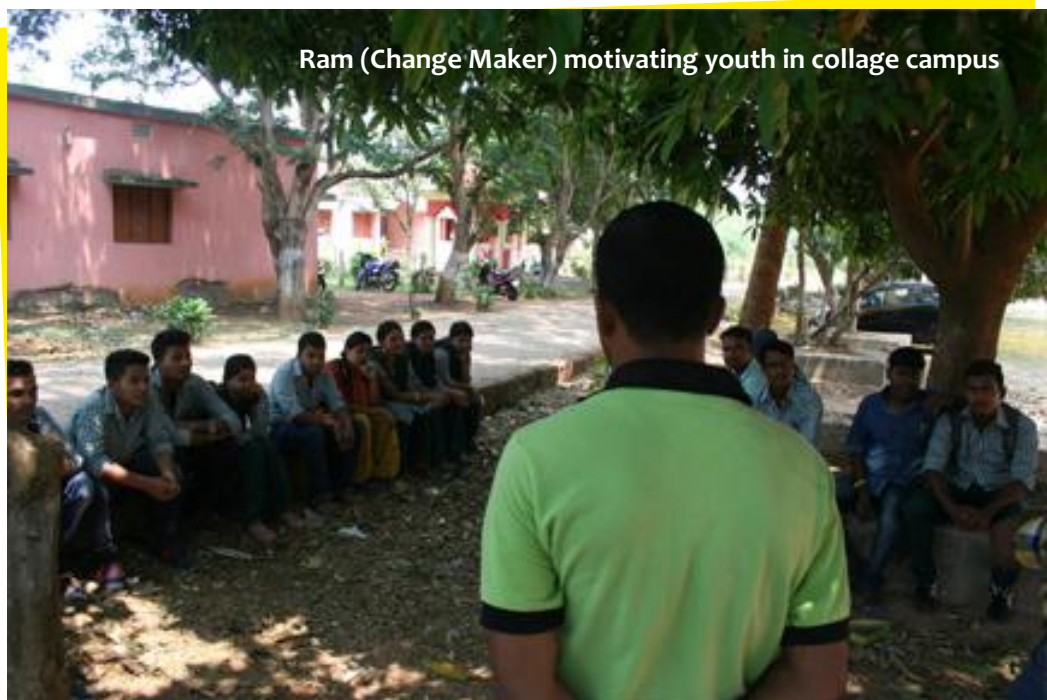
Ram (Change Maker) motivating youth in collage campus

Awareness among the youth on gender issues, including VAW, was lacking when the campaign started. 'Gender' was only used as a term to distinguish between men and women. Events of national significance such as the 2012 Delhi gang-rape incident which elicited massive protests in Delhi and major cities across the country, and occasioned critical changes in the provisions