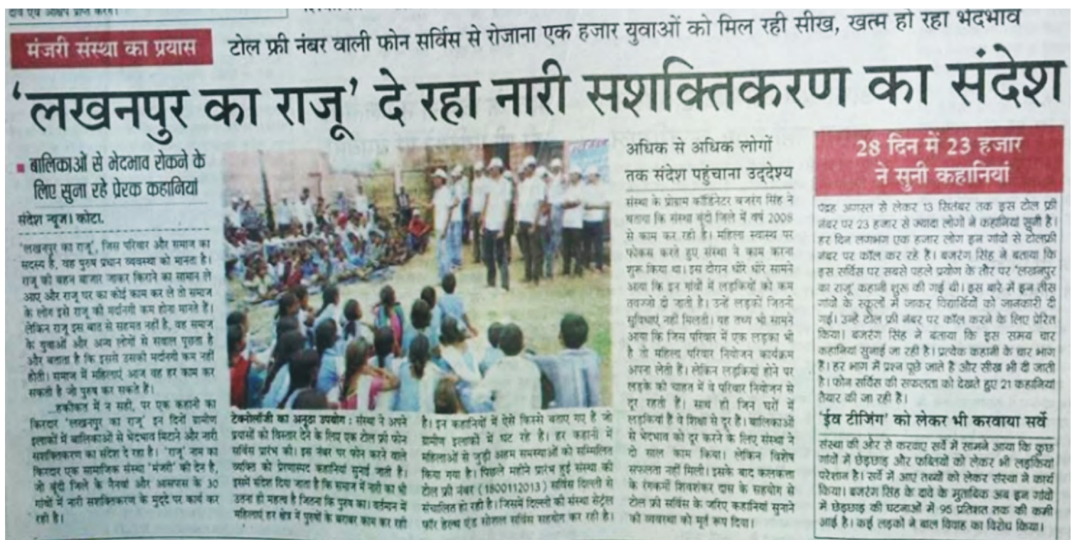
Local newspaper coverage of Kishor Varta

To continue the project subsequently, Kishor Varta stories have been either copied onto memory cards of students by facilitators or they are made to listen to them on facilitators' laptops. For example, 247 memory card transfers were made of Kishor Varta stories in January-March 2016 among community-level youth; and in schools 1116 students during the same time period heard the stories through the facilitators during various interactions; 821 girls and women at the village level heard the stories; 52 older